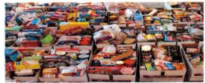
Feed the Hungry

Committee heads, please submit your year- end reports by Jan. 15 th , 2026.