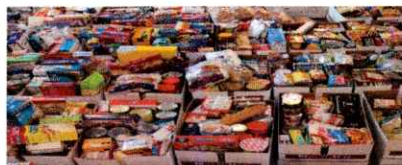
Feed the Hungry