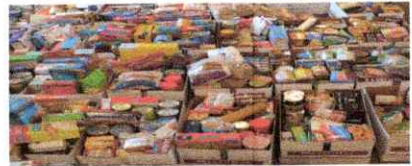
Feed the Hungry

Cookie Crunch will be on February 15 th , 2026 following worship.