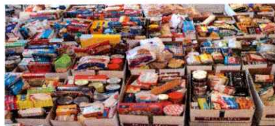
Feed the Hungry

Poinsettia orders are being taken through December 21 st , 2025. Poinsettias are $15.00 this year. Put your order form and check in the collection plate.