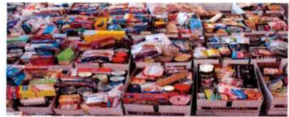
Feed the Hungry

Congregational Meeting on January 18 th , 2026, to vote on officers. Meal after the meeting – PDC will provide the meat, please bring sides and dessert.