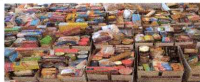
Feed the Hungry